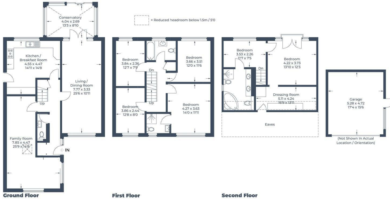
Illustration for identification purposes only, measurements are approximate, not to scale. © CJ Property Marketing Produced for Chandlers