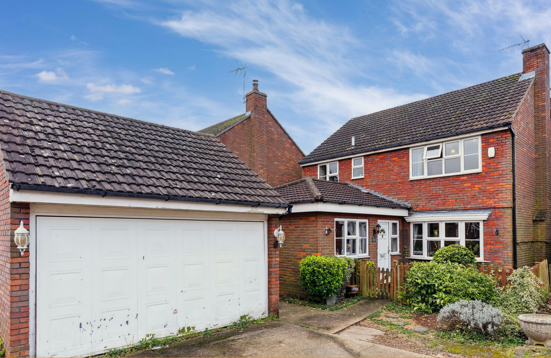
Norton Green, Stevenage